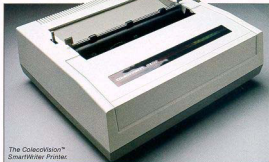
The ColecoVision™ SmartWriter Printer.

The AdamNet concept is similar to a perfectly-matched audio component system with all components working in harmony. The keyboard, printer and memory console function independently and in unison. Each component performs its specific task under the direction of the Memory Console's Central Processing Unit (CPU). The CPU is the microcomputer which orchestrates the activities of the other components. The result: Adam has the ability to perform many tasks simultaneously.